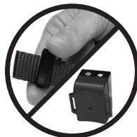
figure 3 a/b

Remove the keeper from the strap. (figure 3a) Orient the device so that the fill port and spray valve are facing up and the battery compartment is facing you. (figure 3b)